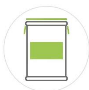
210 Kg DRUM