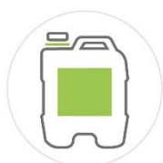
20 Kg DRUM