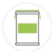
255 Kg DRUM