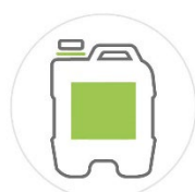
15 Kg CANISTER

Please verify the packaging details, including volume and availability, with your sales representative, as they may vary depending on the production facility where the product is manufactured.