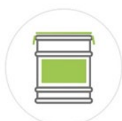
30 Kg DRUM